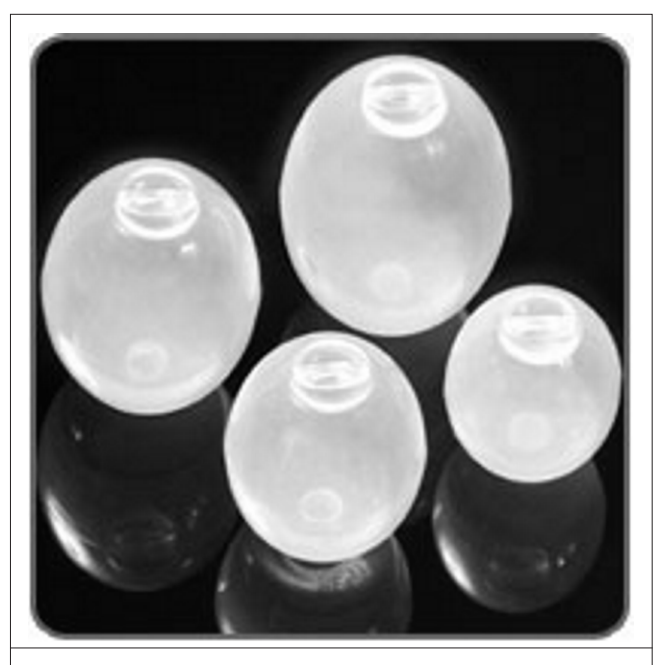
Figure 1 Mentor saline-filled prosthesis with suture loop.

Exploration for a cryptorchid testicle and the finding of testicular agenesis or atrophy is the most common indication for insertion of a testicular prosthesis. Indeed, testicular agenesis or atrophy may be present in up to 8–10% of patients who have an inguinal exploration for cryptorchidism. An implant may also be requested following testicular atrophy arising from damage of the testicular vasculature during orchidopexy, inguinal hernia repair or varicocele ligation. A non-viable testis identified at exploration for testicular torsion or testicular trauma may also