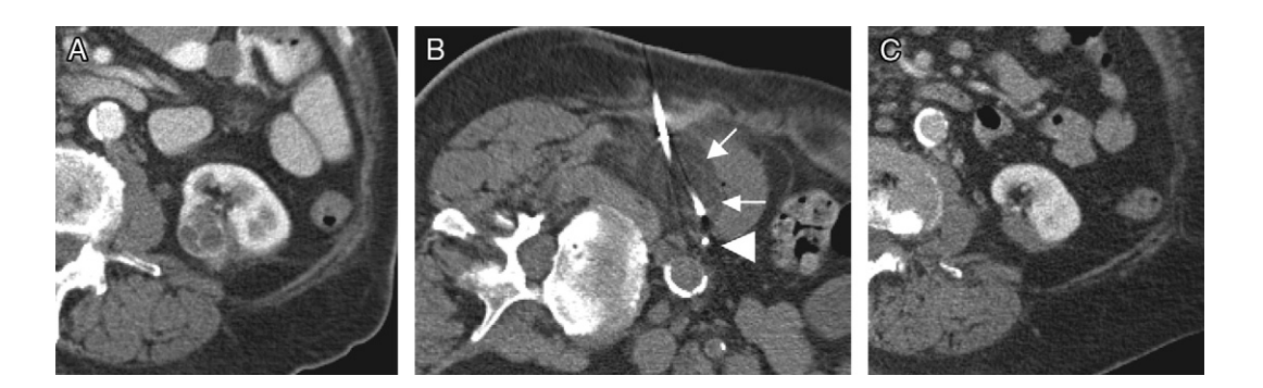
Figure 1. Renal cryoablation imaging findings. A , contrast enhanced CT shows 2.5 cm biopsy proven RCC recurrence in left partial nephrectomy bed. B , noncontrast CT during cryoablation demonstrates low attenuation ice ball (arrows) surrounding cryoprobes and completely encompassing target mass. Retrograde pyeloperfusion was performed via externalized ureteral stent (arrowhead) during procedure to protect adjacent ureter. C , contrast enhanced CT 46 months after cryoablation shows small post-ablation scar but no evidence of recurrent tumor.

wise function and a log normal function with a 95% CI. Survival analysis was performed using JMP® version 9.